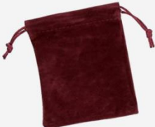
3. Put into Velvet bag