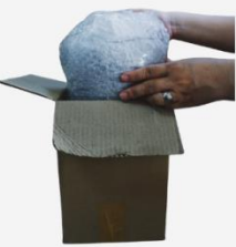
5. Packed in carton box