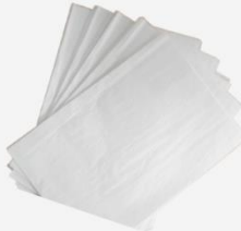
2. Wrapped by paper layer