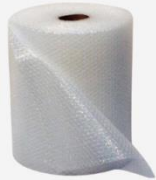
4. Wrapped by Bubble foam