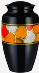
1. Finished products